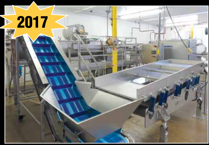
NSEP Salad Spread Mix Line