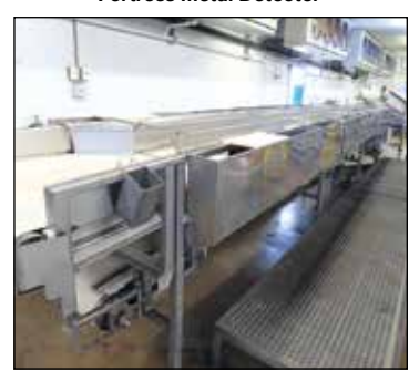
Salad Inspection Cleaning Line