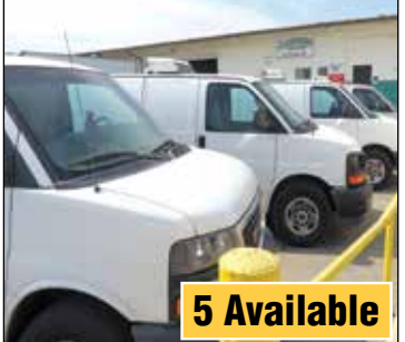
GMC Savant Del Vans