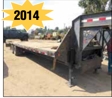
PJ 30' Tilt Gooseneck Trailer