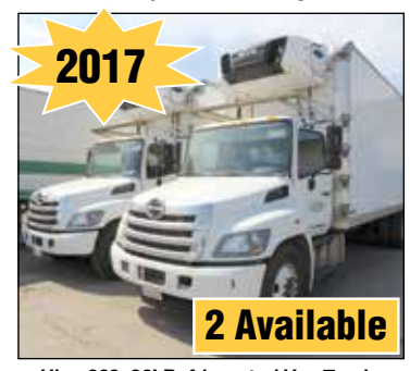
Hino 268, 26' Refrigerated Van Trucks