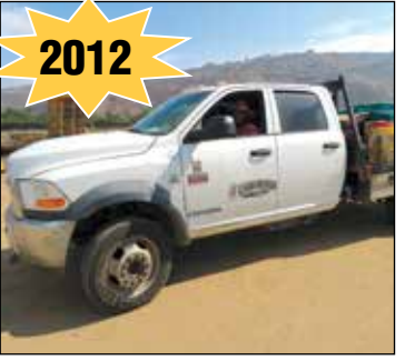
Dodge 5500 Flatbed Truck