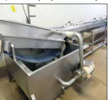
Salad Wash Line