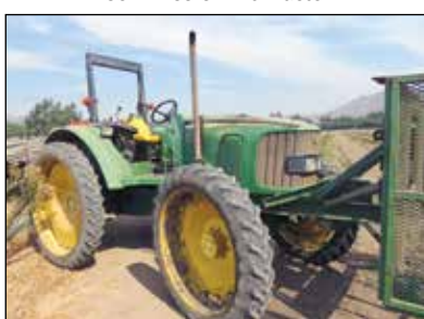
John Deere 6310 Tractor