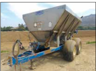
Doyle RC-000-001 Compost Spreader