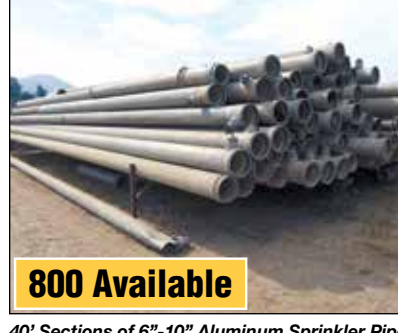
40' Sections of 6"-10" Aluminum Sprinkler Pipe