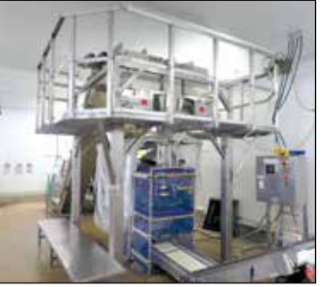
llapak 1000/Weigh Right Dual Head Weigher