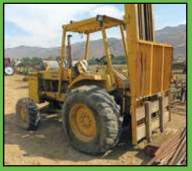
Harlo H6000 Forklift