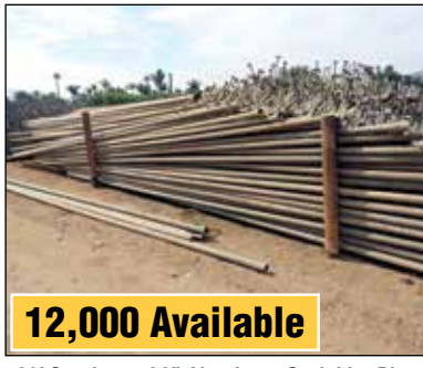
30' Sections of 3" Aluminum Sprinkler Pipe