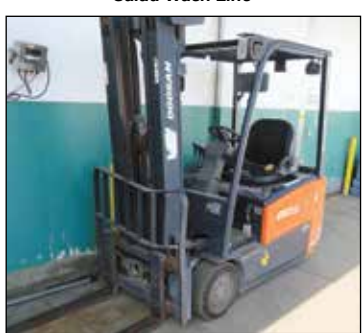
Doosan 20 EPB/ODB Electric Forklift