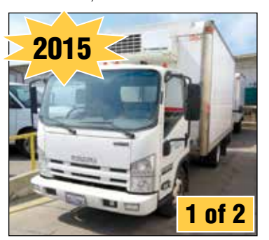
Isuzu 15' Refrigerated Van Trucks