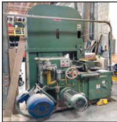
Oliver/FOD 36" Heavy Duty Vertical Band Saw