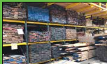
Enormous Qty. of Usable Wood Inventory