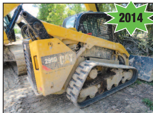
CAT 299D Skid Steer