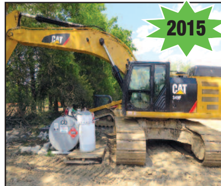
CAT 349FL Excavator

1966 Stacy 65' x 24' Tug Boat, Engine 36M 12V7NA/1200