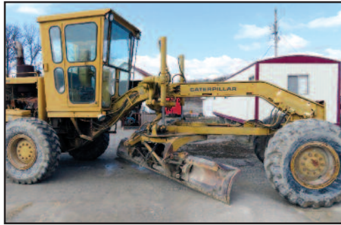
CAT 12G Motor Grader