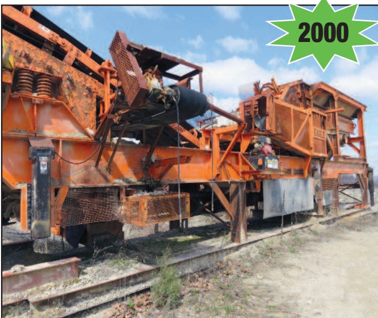
CEC Minyu MS5432 32" x 54" Portable Jaw Crusher

Holiday Inn Airport West Earth City 3400 Rider Trail South, Earth City, MO 63045