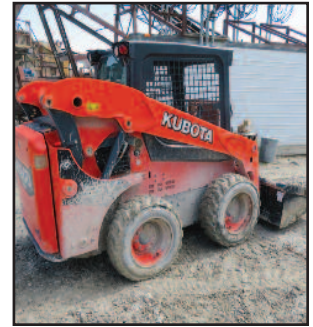
Kubota SSV65 Skid Steer Loader