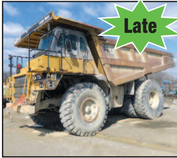
CAT 775D Rock Truck