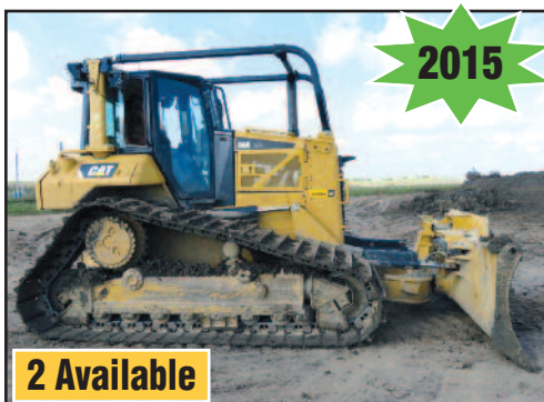
CAT D6N Dozer