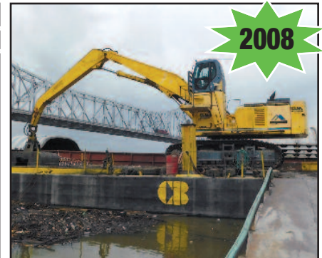
Kubota SK850LC Excavator