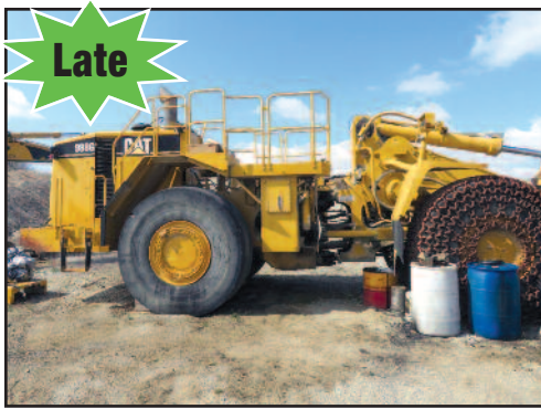
CAT 988G Wheel Loader