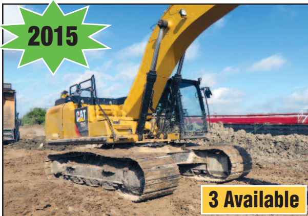
CAT 336FL Excavator

1999 CAT 322BL Excavator, w/Breaker, S/N 2ES00714