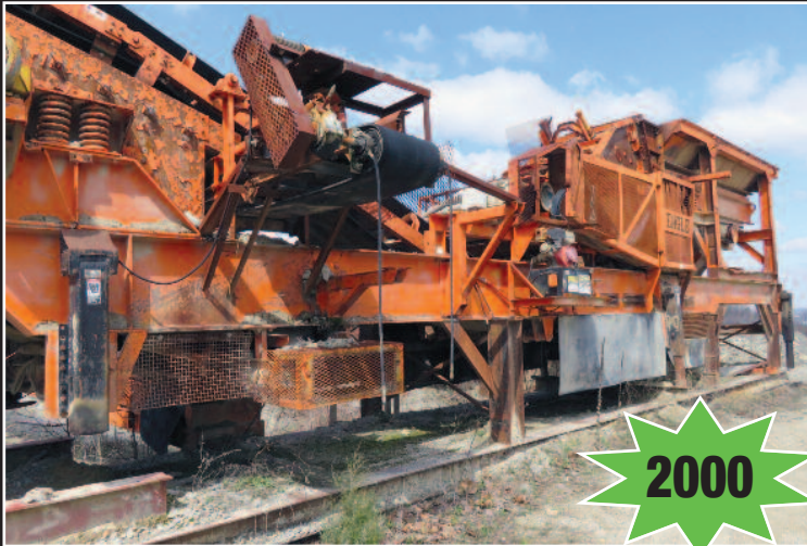
2000 CEC Minyu MS5432 32" x 54" Portable Jaw Crusher