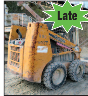
Case Box & Skid Steer