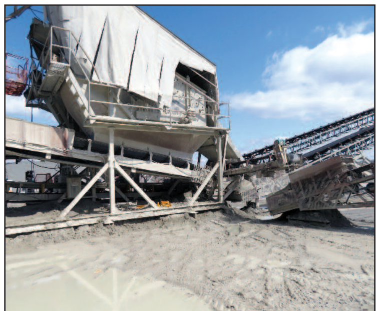
Allis Chalmers 6' x 16' 3-Deck Incline Screen