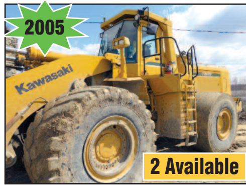
Kawasaki 115 Wheel Loader